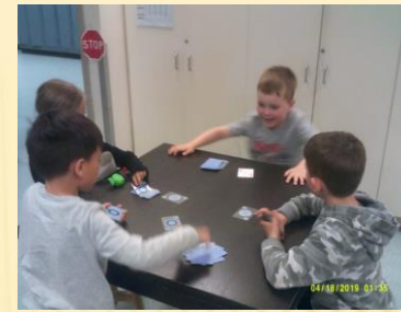
The children playing various card games that we have learned this month.