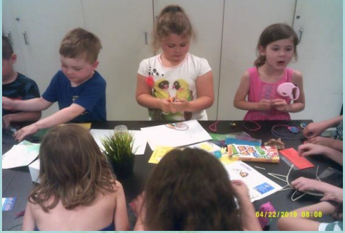
Experimenting with Wikki Stix